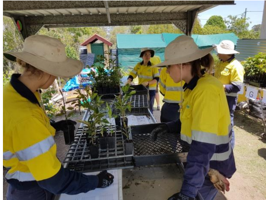
Species randomization as part of the 20 Million Trees research planting