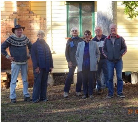
Creekcare volunteers at Myall Park Glenmorgan

Our volunteering at Myall Park Botanic gardens for their open day in August has become an annual event and this year the area experienced good rain just before our visit. As a consequence of local flooding, we had to wait until the water dropped at the causeway before we could get in. The Gardens looked terrific with the spring flowers in abundance and we had a productive stay helping to prepare for the Open Day. An added bonus this year was the Offshoots art exhibition, an exhibition of botanical art which featured first class exhibits.