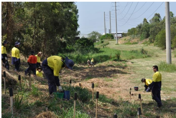
CreekWatch Works at Granard Wetland