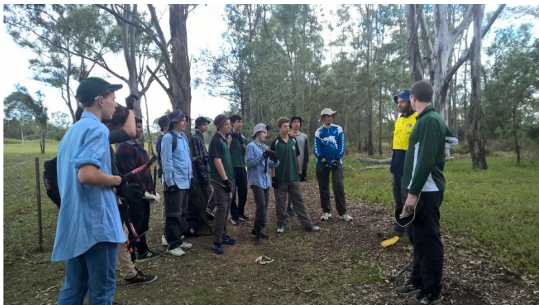
Students from Brisbane Boys College at Oxley Golf Complex

Activities have included planting, weeding, rubbish removal, macro-invertebrate sampling, water quality testing, catchment tours, and leaf litter surveys. Topics covered include storm water, erosion, weeds, litter, water quality, nutrients, active citizenship, bush rehabilitation, catchments, and awareness of local waterways.