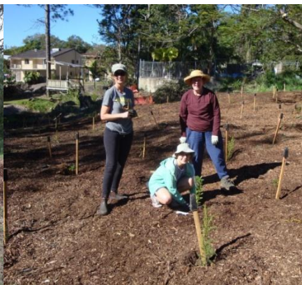
Community members at a Peaks to Points Festival planting