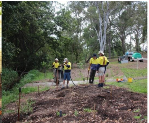
CreekCare volunteers doing long stem planting at Benarrawa Park