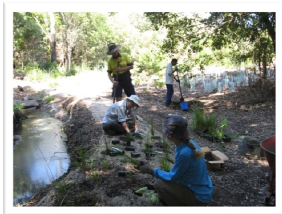
Benarrawa Park creek bank January 2012 and June 2016