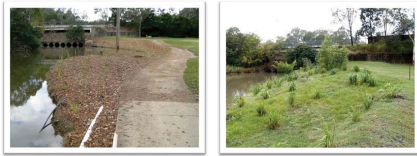
Jindalee Golf Club –area cleared with initial planting (left) 12 months later (right)

Biodiversity Services also moved further afield when it was contracted for a weed management project on a series of adjoining properties backing onto a watercourse near Lacey's Creek, Dayboro.