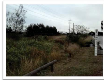
Granard Wetlands, Marshall Road after clearing and planting in September 2009 and again in May 2016

Current Biodiversity Services projects include: