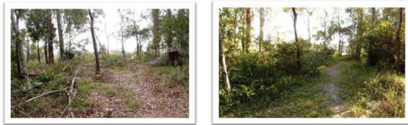
Watson Road State School before and after clearing, weeding and planting