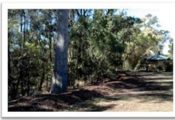
Nosworthy Park before and after infill planting by Biodiversity Services

Previous staff and those who currently work for Biodiversity Services have been a constant source of knowledge and experience. They have all been committed to ensuring the highest standard of care for the environment and are to be commended for their commitment, hard work and good humour. Our thanks go to all the Biodiversity Services staff who have been part of the journey over the years: