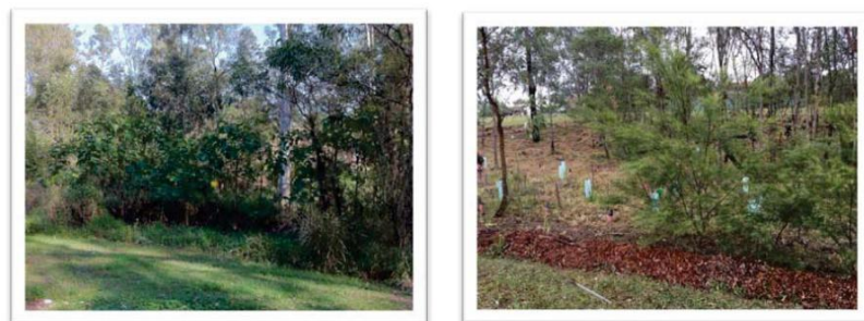
Before and after weeding and replanting at Wood Park, Middle Park

In 2013 Biodiversity Services strengthened its relationship with Wolston and Centenary Catchments and undertook revegetation and maintenance work at project sites at Jindalee Recreation Reserve and at Wood Park, Middle Park.